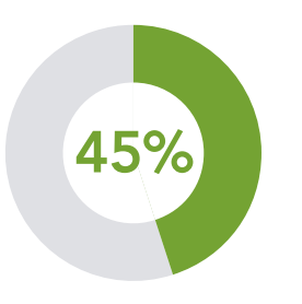
45% of people claim Social Security benefits at age 62 – before their full retirement age.<sup>3</sup>

10,000 baby boomers will turn65 each day for the next 15 years.<sup>2</sup>